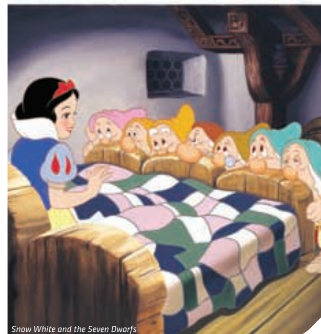
Snow White and the Seven Dwarfs

COST: $10 PER STUDENT (MINIMUM 30 STUDENTS)