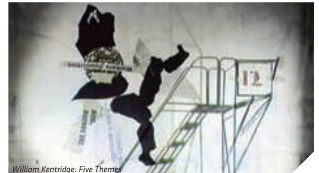
William Kentridge: Five Themes

Teachers can book an introductory talk to engage students, provide background knowledge and explore key themes. Alternatively teachers can register to lead their students on self-guided tours of an exhibition.