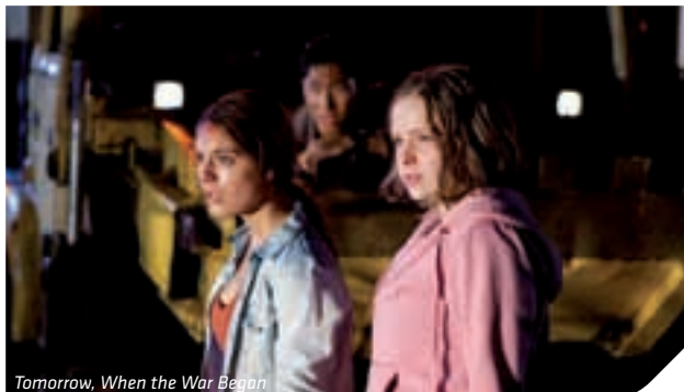
Tomorrow, When the War Began

For early levels, these programs consist of a film screening and a short introduction or discussion, while programs for the later levels incorporate a screening plus a longer lecture. The programs are designed to introduce students to some of the codes and conventions used in screen texts. They assist students in developing screen literacy skills that allow them to appreciate the art and craft behind the moving image by encouraging them to think beyond the screen.