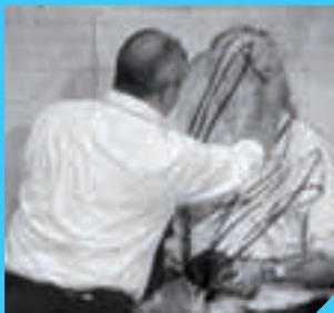
William Kentridge: Five Themes

Kentridge deftly combines the political with the poetic and is highly regarded for work that reveals strong links to the social and political environment of his home country, tackling issues of colonial oppression, reconciliation and the transient nature of individual and shared memory.