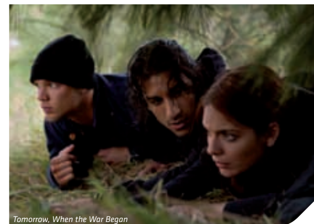
Tomorrow, When the War Began

COST: $10 PER STUDENT (MINIMUM 30 STUDENTS)