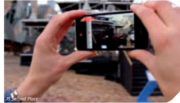
15 Second Place

These intensive full-day or part-day experiences are powerful instigators for creative production. They provide a full educational arc, from theory to production, to exhibition back to theory, and are a meaningful way for students to learn in a creative context. All workshops are held in our state-of-the-art facilities and help develop students' technical skills and knowledge of the moving image.