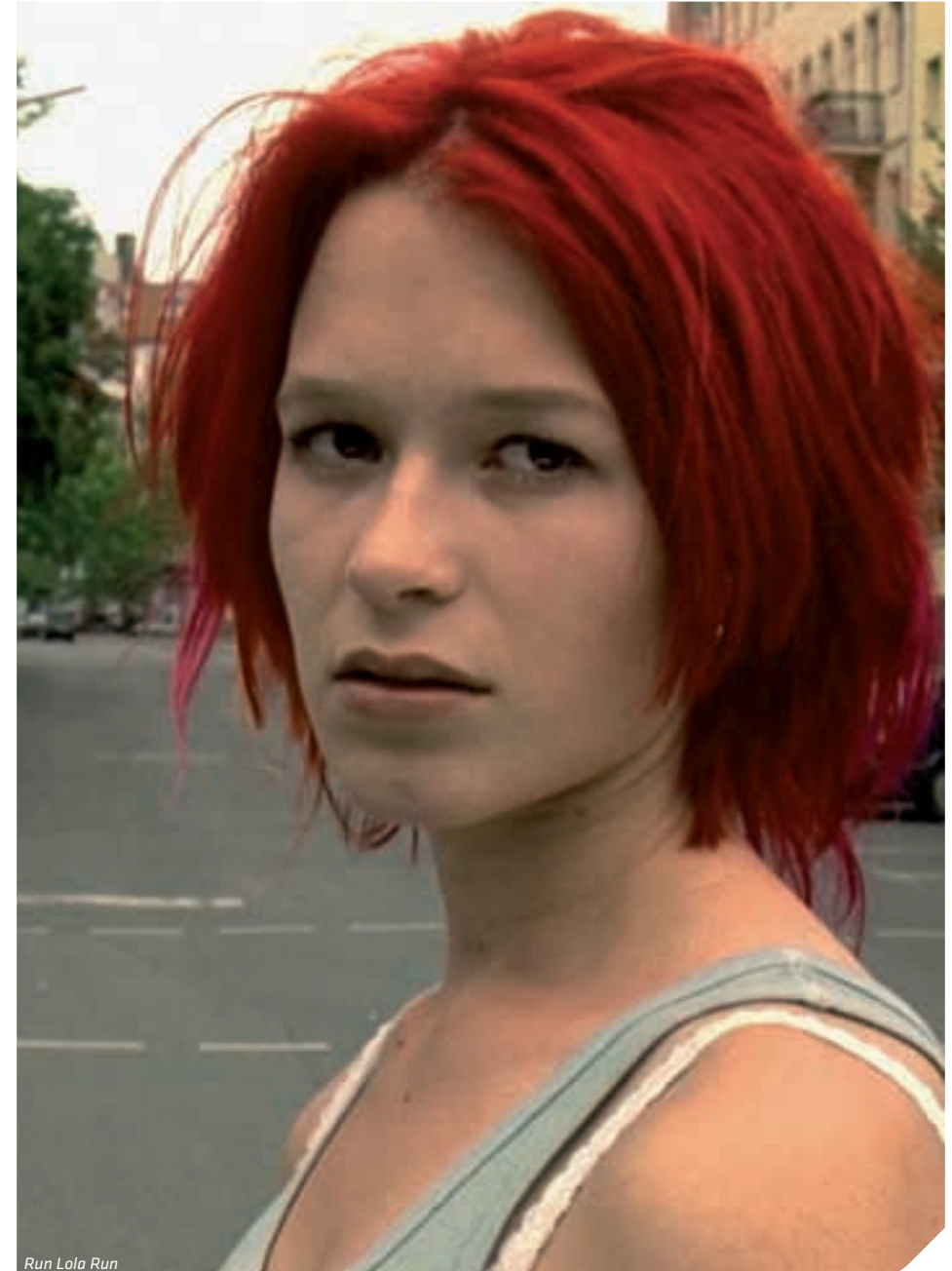
Run Lola Run

The program helps to alleviate the burden of travel costs to and from the city's arts precinct and provides access to a range of dynamic and exciting performances and programs at ACMI and other leading Victorian cultural organisations. For information about this program contact the Arts Centre on 03 9281 8714 or email artsconnect9@theartscentre.com.au