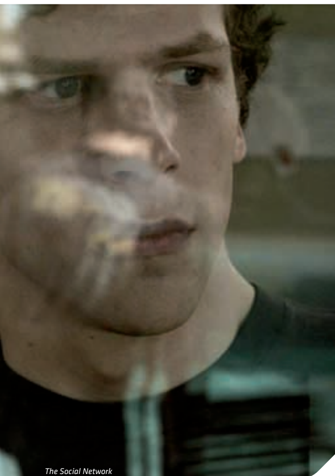
The Social Network