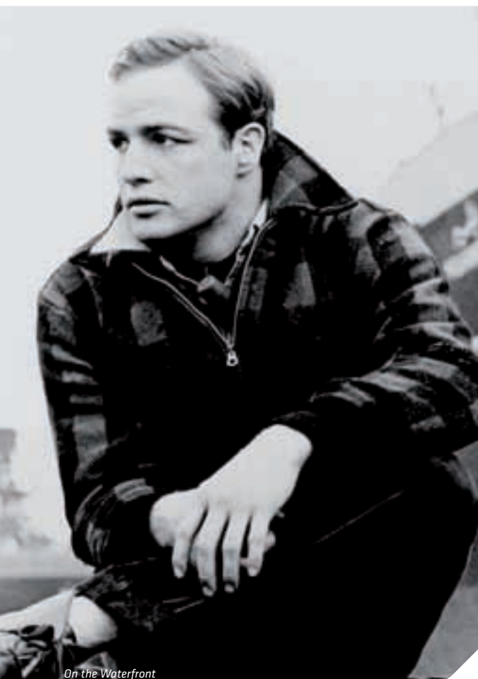
On the Waterfront