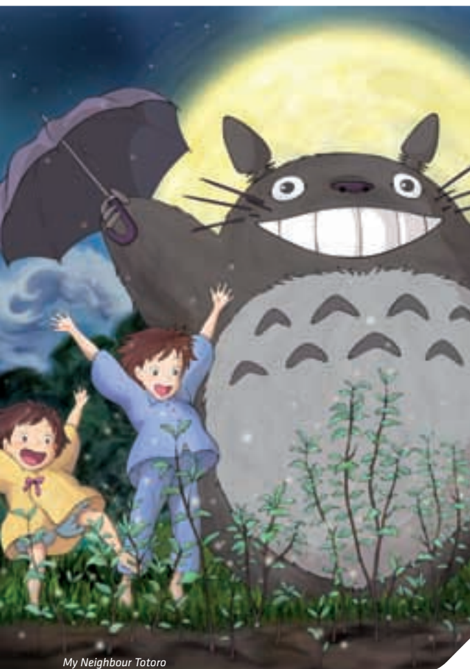
My Neighbour Totoro