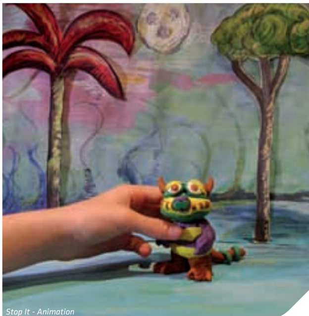
Stop It - Animation