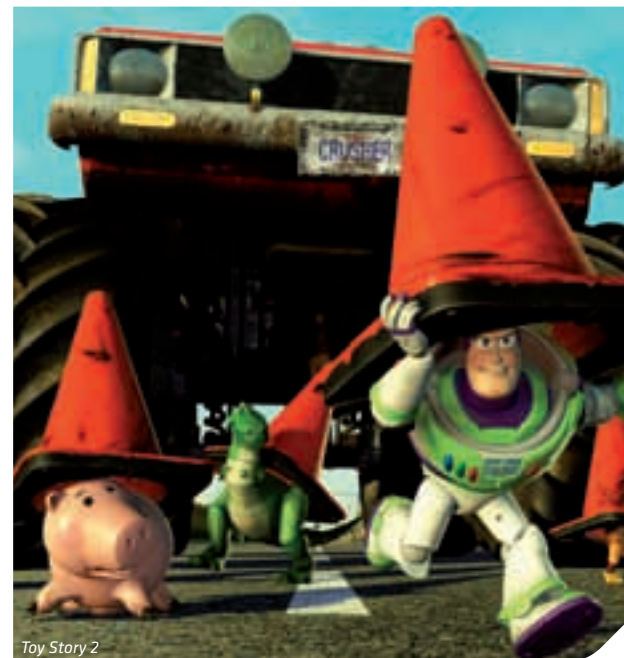
Toy Story 2

COST: $10 PER STUDENT (MINIMUM 30 STUDENTS)