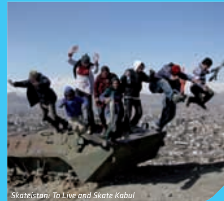
Skateistan: To Live and Skate Kabul

This program supports the Victorian Essential Learning Standards across the domains: The Arts, English, Humanities, ICT and Thinking Processes. For a list of films and session times, please contact screeneducation@acmi.net.au or phone 03 8663 2441 after Friday 31 August 2012.