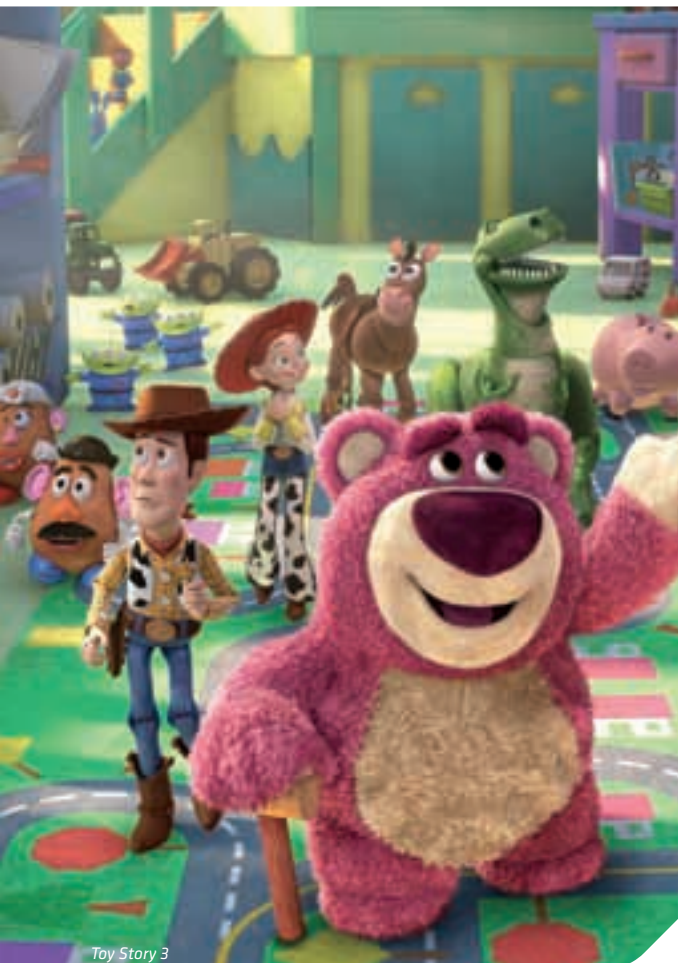
Toy Story 3