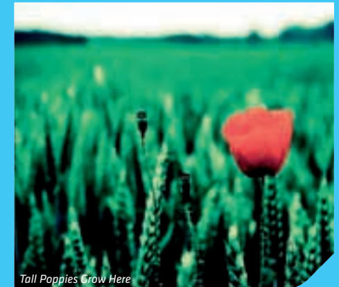
Tall Poppies Grow Here

All sessions are free with limited spots available. For more information or to register for upcoming sessions, visit: www.acmi.net.au/intermix or email intermix@acmi.net.au